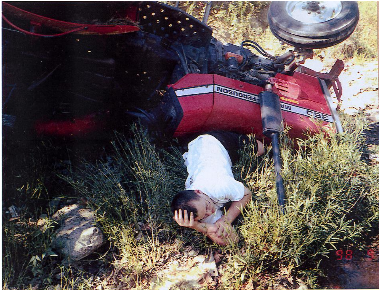
What Really Happened- Photo 7