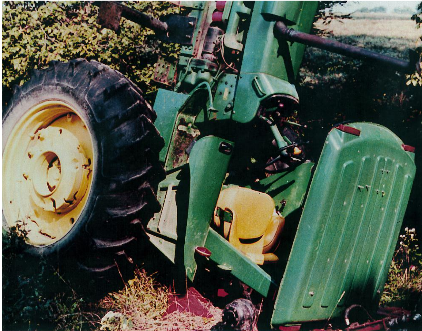
What Really Happened- Photo 8