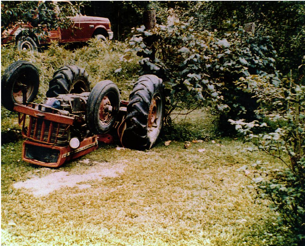
What Really Happened- Photo 1