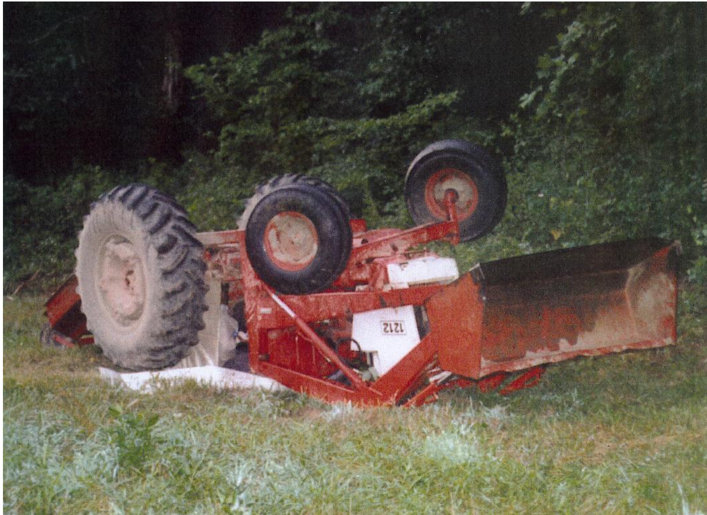
What Really Happened- Photo 10