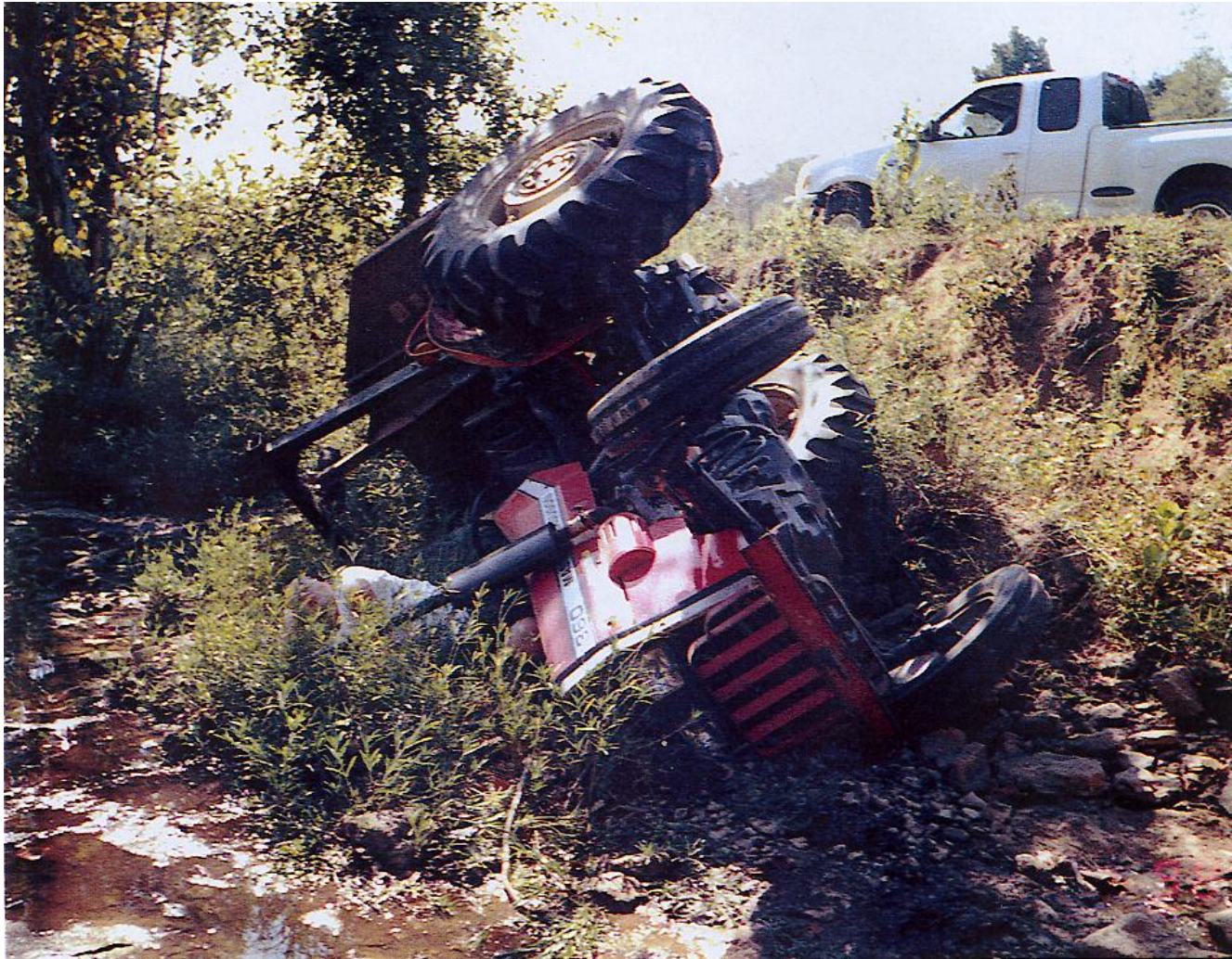
What Really Happened- Photo 6