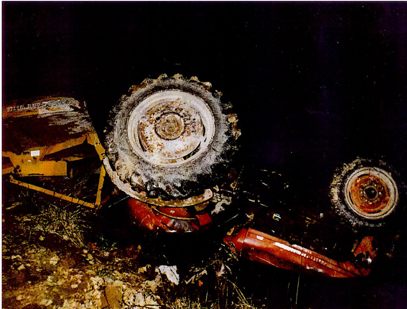
What Really Happened- Photo 2