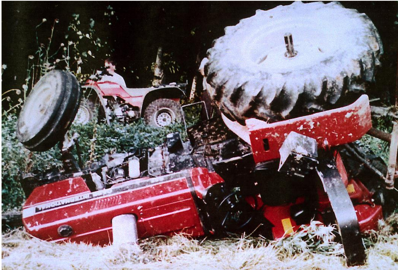
What Really Happened- Photo 4