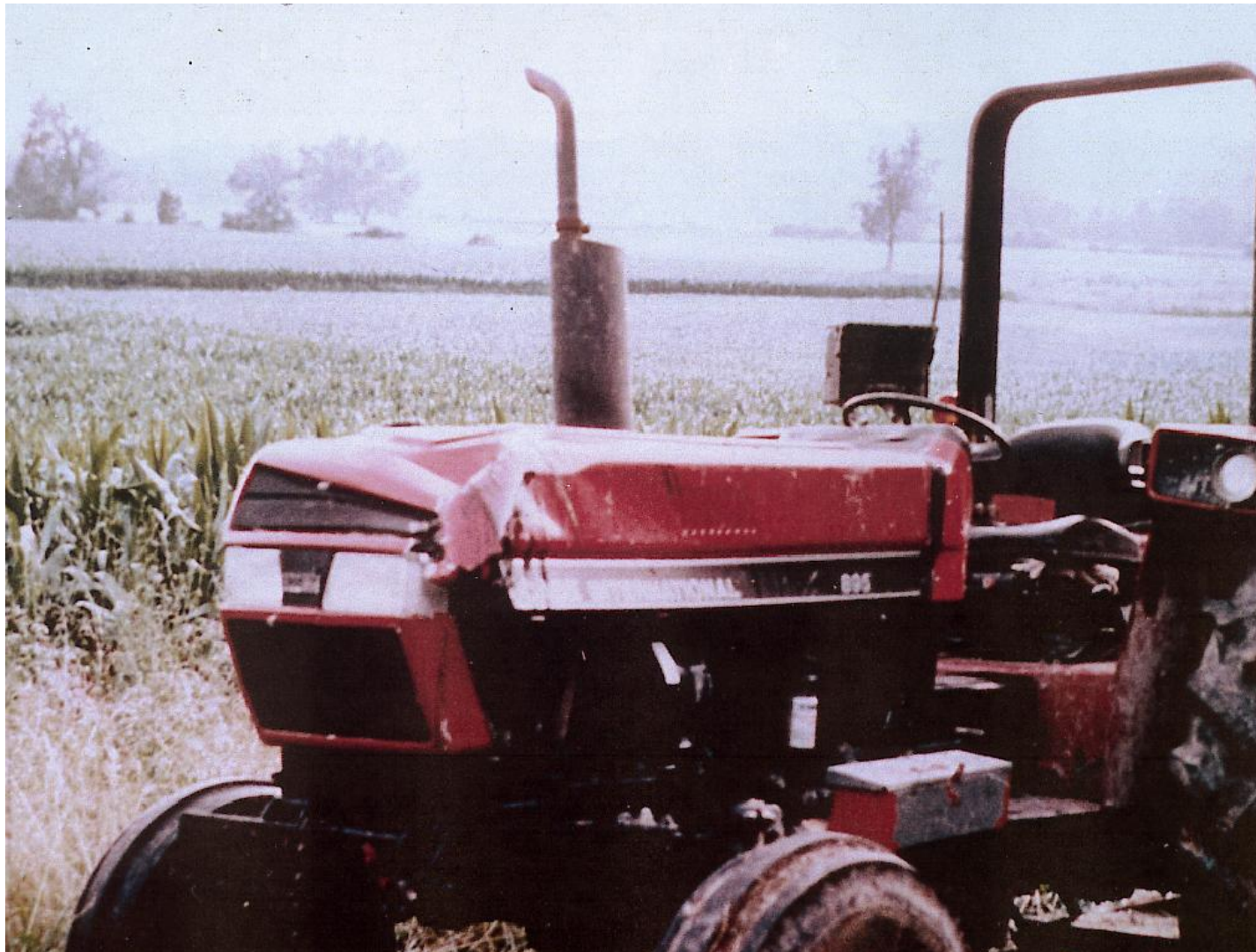
What Really Happened- Photo 5