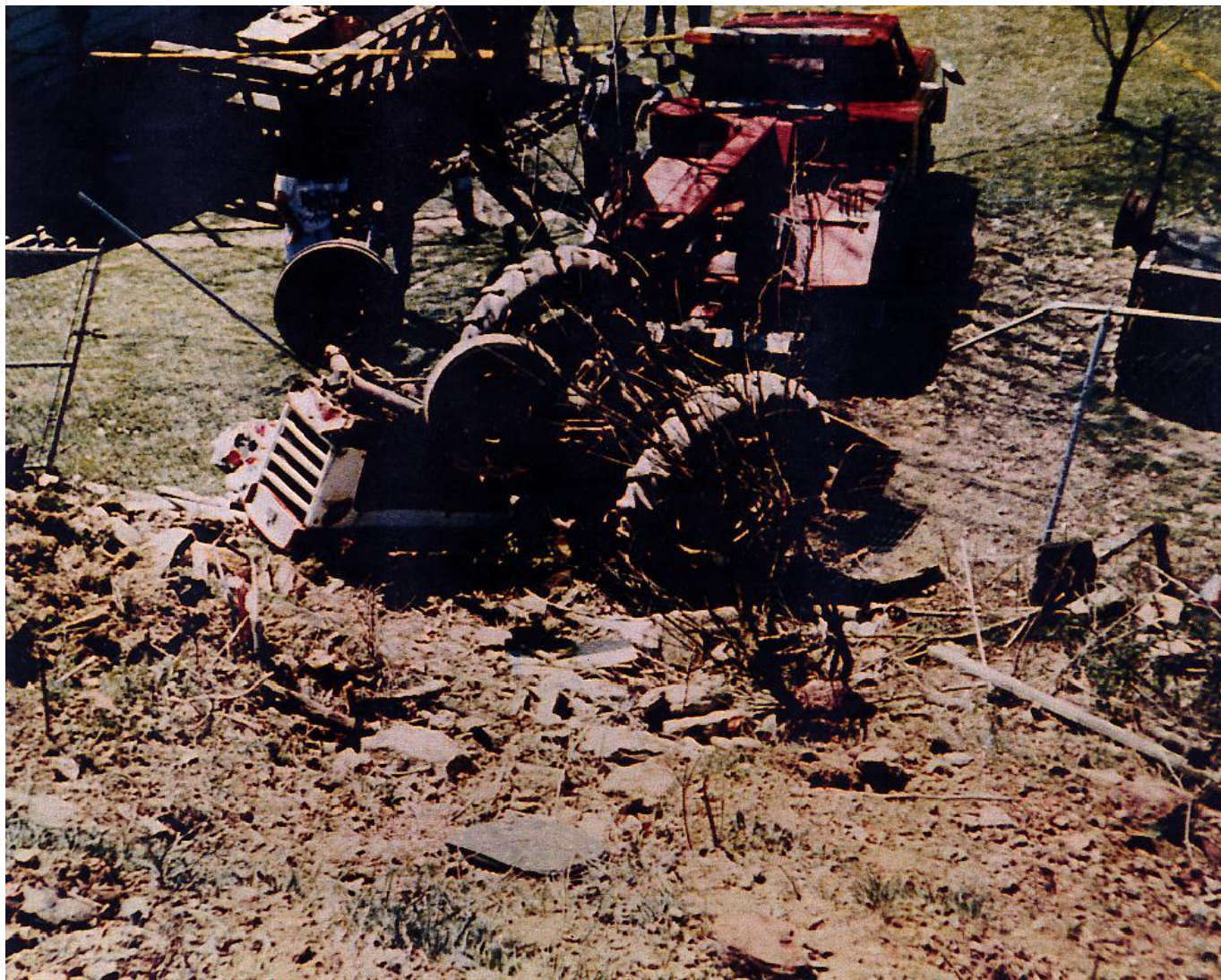
What Really Happened- Photo 3