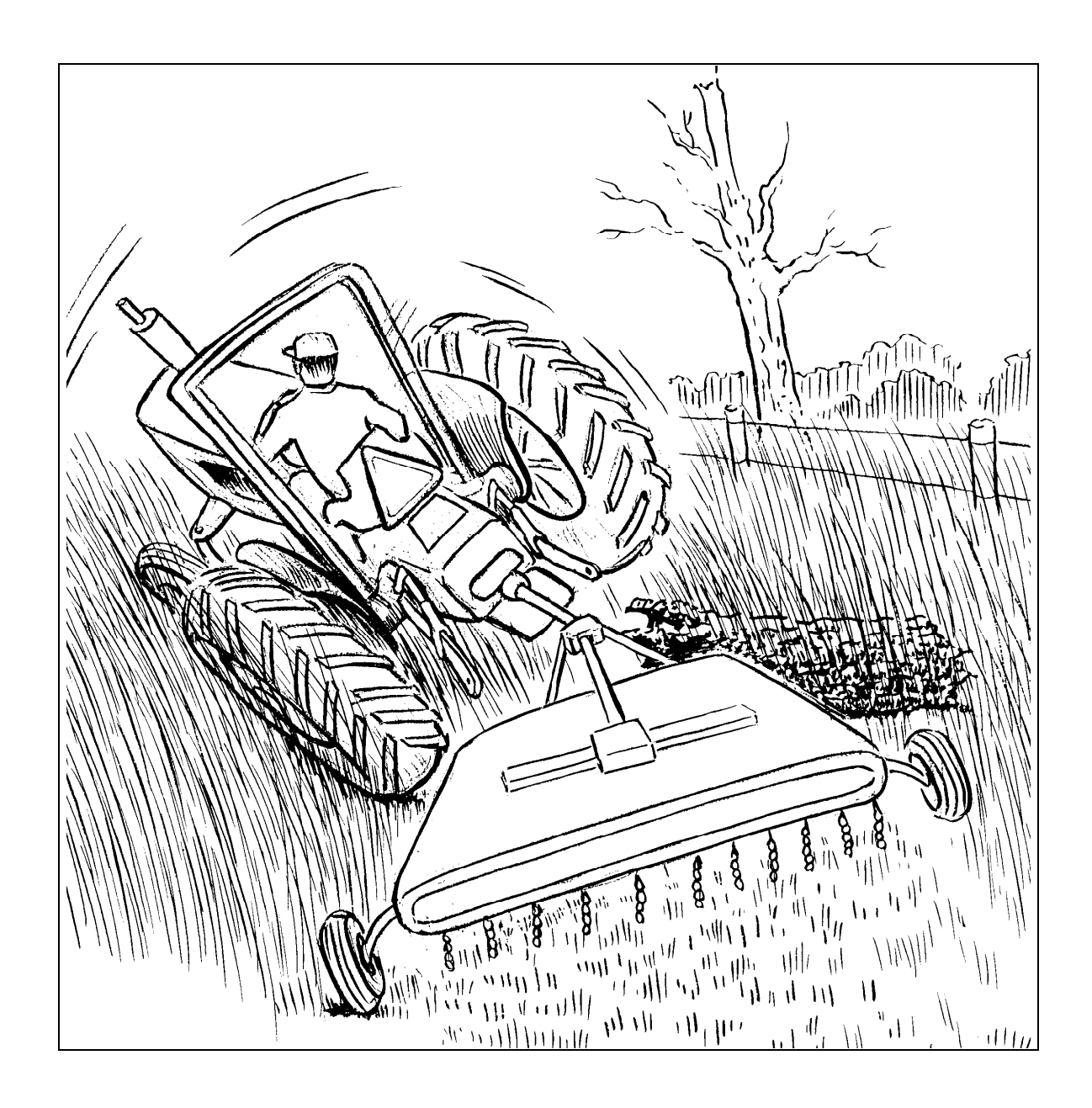
Figure 2: The tractor strikes a log and starts to overturn