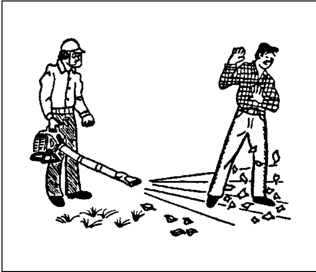
Figure 2. NEVER point the blower at someone.