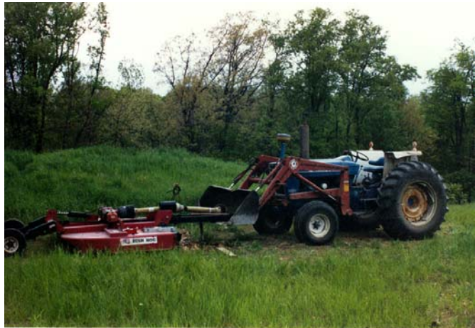
Figure 1. Incident Scene