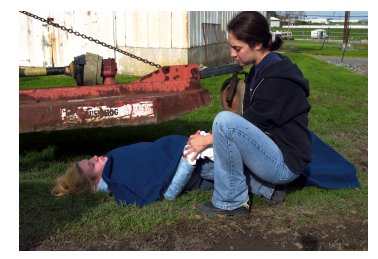
Farm Family Emergency Response is a program that teaches family members and farm employees how to make important decisions at the scene of a farm emergency.