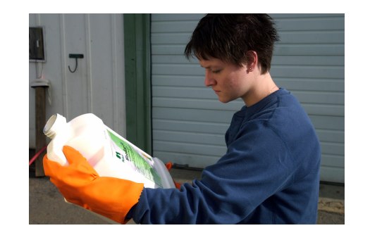
Farm Family Emergency Response helps farm family members to use critical thinking to help solve problems.