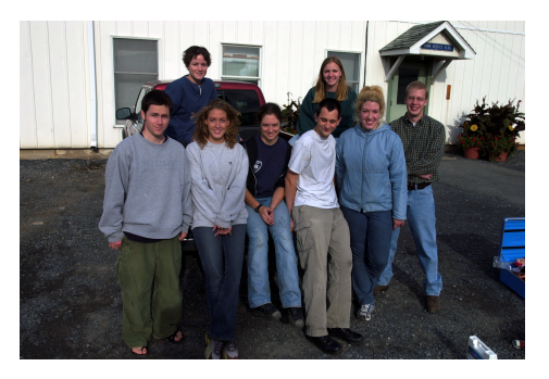
The Farm Family Emergency Response Program is ideal for farm groups of all ages.