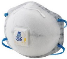
N95 Respirator used to reduce workers' dust exposure.

Dangerous bacteria and molds exist in livestock dust. Breathing dust may lead to respiratory conditions like allergies or asthma in bison handlers. It is important to reduce the amount of dust that is inhaled during bison roundups. To reduce the amount of dust being inhaled, masks such as two strap NIOSH approved masks (N95 respirators) can be worn. Instructions for use on the packaging must be followed to ensure complete protection. Workers can decrease dust at roundups by spraying dusty areas with water.