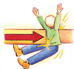
Lift arms can pin operator