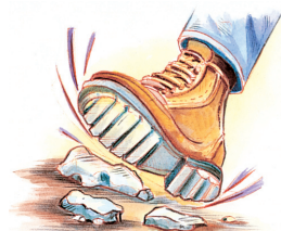
Slippery/uneven surface can lead to slips, trips and falls