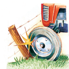
Collision with obstacles can cause injury