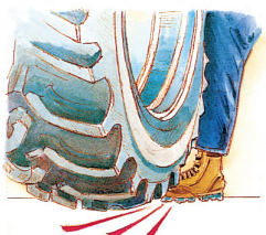
Tractor runover can cause death or disability