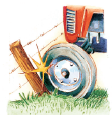
Collision with fences and trees can cause injury