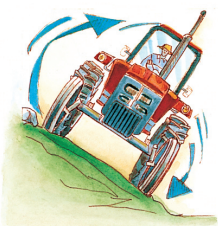
Tractor rollover can cause death or disability