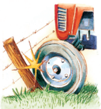
Collision with fences and trees can cause injury