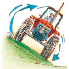
Tractor rollover can cause death or disability