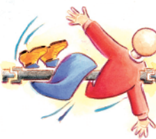
Moving parts can entangle arms, legs hair and clothing