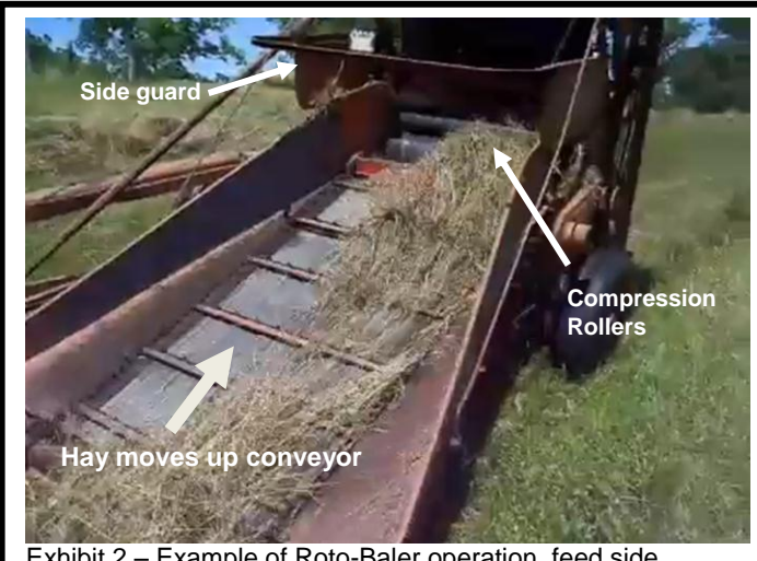
Exhibit 2 – Example of Roto-Baler operation, feed side

Operation of this baler requires a tractor connection via a PTO. The baler is offset behind the tractor, so the driver looks left to align the baler with the cut hay. As the baler moves through cut hay raked into windrows, forks at the front lip pull the hay up a conveyor belt (Exhibit 2) to a rotating bar that feeds the hay between two compression rollers. A belt and roller system on the back side rolls the hay into small round bales (Exhibit 3). When the bale is the right size, the stringing mechanism automatically engages at which point the operator typically stops the tractor while twine wraps around the spinning hay bale. The bale is then automatically ejected from the back of the baler and the tractor and baler move forward again.