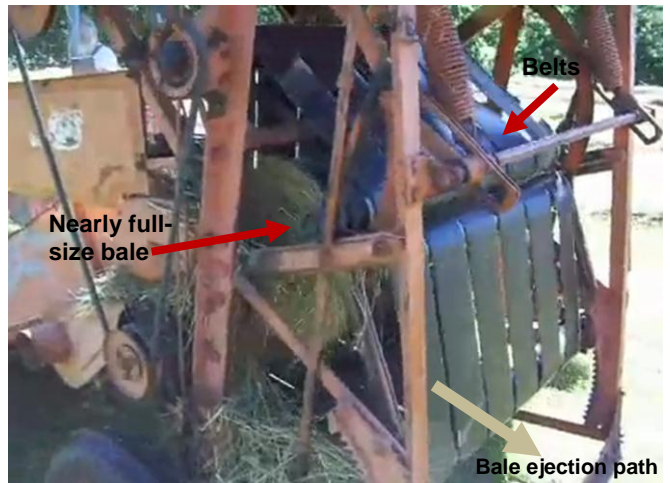
Exhibit 3 - Example of Roto-Baler operation, baled side

The morning of the incident, the farmer left for the field once the dew had burned off. A neighbor saw him riding the tractor at 11:45 AM. At some point between 11:45 AM and 12:30 PM, the farmer stopped the tractor (leaving it running), walked back to the back, left side of the baler, and got his hands pulled into the compression rollers at the top of the conveyor. This action pulled in his arms nearly to the elbow. As the rollers drew the victim into the baler, it pulled him into the sidewall of the conveyor, compressing and crushing his chest.