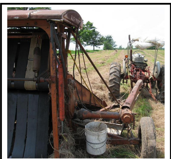
Exhibit 1 – View of tractor and attached Roto-Baler involved in this incident

The farmer had purchased the Roto-Baler at a farm sale approximately 8 to 10 years before the event. Over the years, he had worked on this and other mechanical equipment, and his wife indicated he often purchased older machinery and fixed it up. Before his retirement 23 years earlier, the farmer worked in heating and air-conditioning repair, indicating a long life of working around mechanized equipment. The farmer had indicated to his family that this would be his last