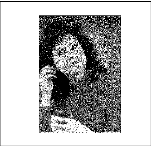
Figure 1. Ear plugs