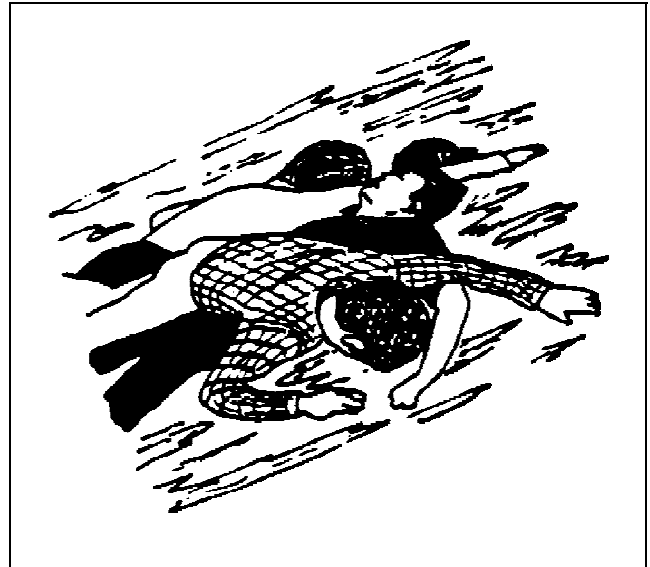
Figure 1. Manure pit accidents often result in multiple fatalities

Manure storage hazards include gases that are toxic (hydrogen sulfide), corrosive (ammonia), asphyxiant (carbon dioxide), and explosive (methane). Drowning is also possible. All of these hazards exist with covered pit type storages. Danger is most severe when manure is being agitated or pumped out, and after emptying if the pit is covered. At other times, gas production is very slight and ventilation from fans or natural air movement