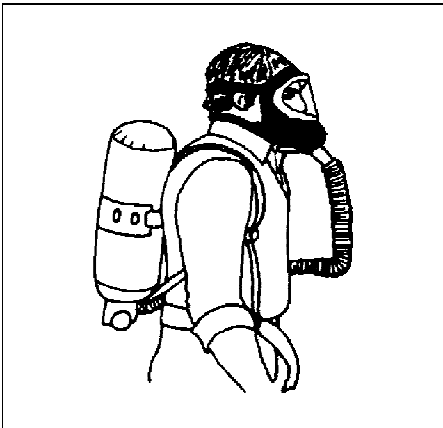
Figure 3. The only safe way to enter a manure pit

low levels. However, the sense of smell is deadened from concentrations much less than that which is lethal. Additionally, the smell is often masked by many other smells common to livestock facilities. The amount of the gas can be increased a thousand-fold during agitation and emptying. Hydrogen sulfide is associated with most