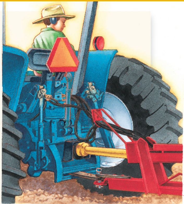
FIELDWORK WITH REMOTE HYDRAULICS