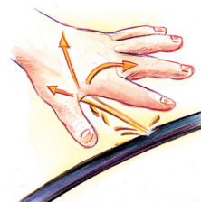
High pressure injection of hydraulic fluid can cause gangrene