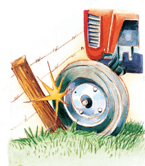
Collision with fences and trees can cause injury