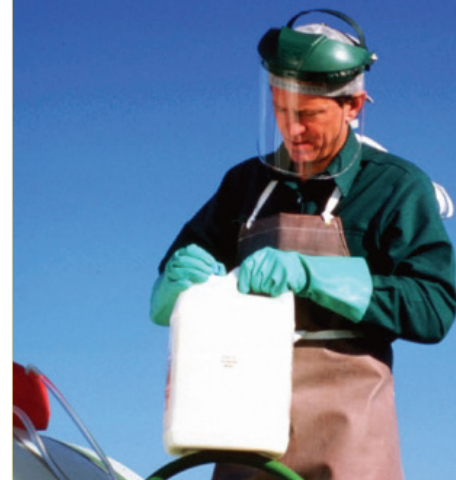
A chemical-resistant apron

Chemical-resistant apron — May be required for mixing and loading pesticide spray tanks or for cleaning equipment. Aprons should be coated on both sides with the resistant material with edges sealed to prevent pesticide absorption and wicking. They should provide full protection of the front of the body from the neck to the knees. A chemical-resistant spray suit may be worn instead of an apron.