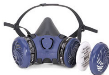
TC-84A-type air-purifying respirator (APR): tight-fitting half mask with a combination Organic Vapor (OV) cartridge and N-95 particulate filter.

Powered air-purifying respirators (PAPRs) – Protection is dependent on proper airflow. A flow meter monitors airflow to determine if the canister or cartridge has become clogged. Follow the manufacturer’s recommendations; do not use the respirator if the airflow is less than the minimum required, typically four cubic feet per minute (cfm) for tight-fitting face pieces and six cfm for hoods or loose-fitting helmets. Batteries must be maintained for these respirators to operate properly. See the NIOSH fact sheet about PAPR batteries on Oregon OSHA’s “ Respiratory protection ” topic page. Opened PAPR canisters or cartridges must be replaced according to the schedule in the product information, even if minimum airflow is acceptable. Always write the date you opened the canister or cartridge on the package. Sealed canisters or cartridges may also have expiration dates that must be followed even if they have never been opened.