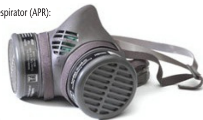
TC-23C-type air-purifying respirator (APR): tight-fitting half mask with Organic Vapor cartridge.