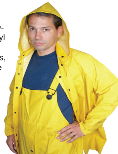
Polyvinyl chloride (reusable)

Chemical-resistant coveralls – A one- or two-piece suit that the manufacturer specifies to be resistant to certain chemicals. Suits made of butyl rubber, neoprene, PVC, or one of the newer coated and laminated polyethylene fabrics may be appropriate. Generally, greater material thickness, bound or sealed seams, and covered zippers and vent holes will increase the protection offered. These garments are often elasticized at the wrist and ankle. Some are reusable if properly cleaned, and some must be disposed of after a single use. You will be safest and most comfortable in protective clothing that fits. Do not use coveralls made from fabrics such as cotton, polyester, or uncoated, non-woven olefin unless the label specifies “long-sleeved shirt and long pants” or “coverall worn over long-sleeved shirt and long pants.”