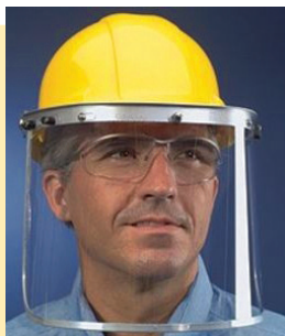
Safety glasses and a face shield

Eye protection – Use the appropriate eye protection level when the label specifies the following: