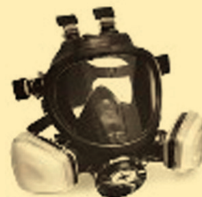
A full-face respirator

Eyewear must meet or exceed the current impact-resistance specification of the American National Standards Institute (ANSI Z87.1). Polycarbonate is lightweight and provides strong impact resistance and good chemical splash resistance.