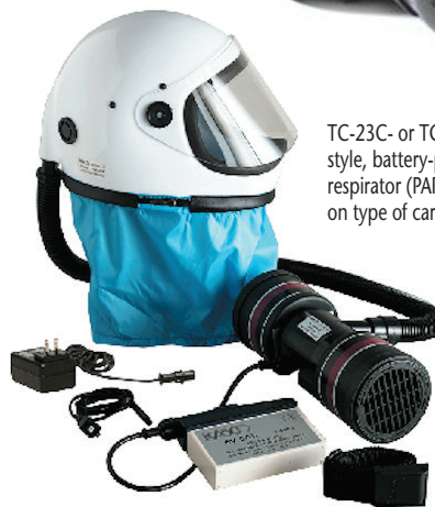
TC-23C- or TC-21C-type, Helmet-style, battery-powered, air-purifying respirator (PAPR) TC number depends on type of cartridge/canister used.