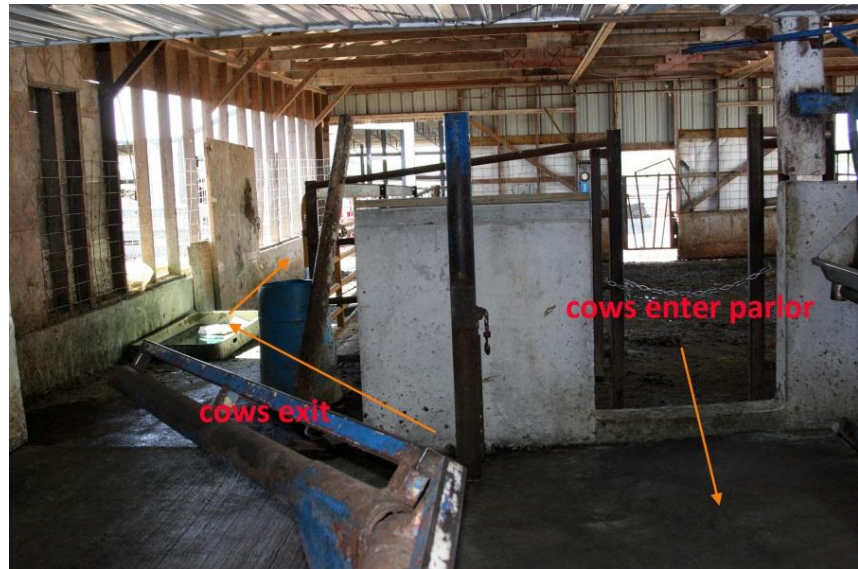
Exhibit 3: Path of cows into and out of milking area. Victim was found at gateway where cows enter parlor.

The daily chores performed by the couple were routine over the years. The wife brought cattle from the nearby barn into the holding area. Cows filed from the holding area into the two open milking areas on either of the milking equipment. The wife secured cows in the two milking areas with metal gates (no longer used at time exhibit photographs were taken) and went into the central area to attach milkers.