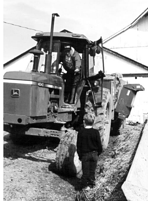
Figure 2. Tractor operators should resist carrying extra riders on farm equipment that has an operator's station for only one person.

These conditions allow a training instructor to walk safely beside or behind a moving machine and to use hand signals to communicate with the trainee. Suggestions for starting and stopping farm machinery safely, and on agricultural hand signals, are available from a variety of sources, including operator's manuals, extension bulletins and other training resources. Contact your equipment dealer or county extension agent to obtain these materials. It is also crucial that instructors use good instructional methods during training.